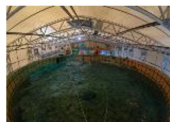
Large indoor aquarium