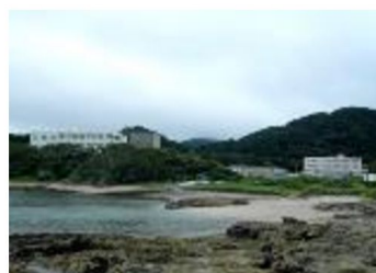
Exterior of station