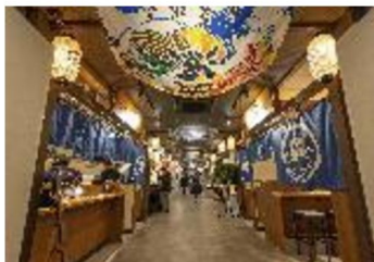
Toyosu Senkyaku Banrai